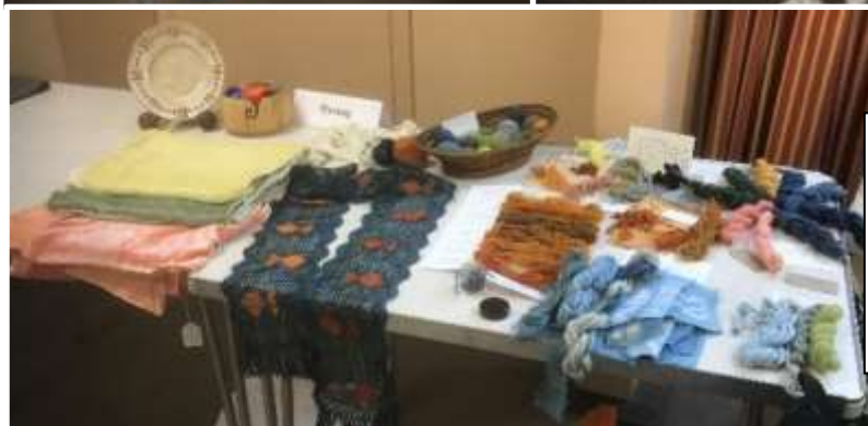
Entries for Diddy (top left), Hawkridge (top right) and Dyeing (left) trophies