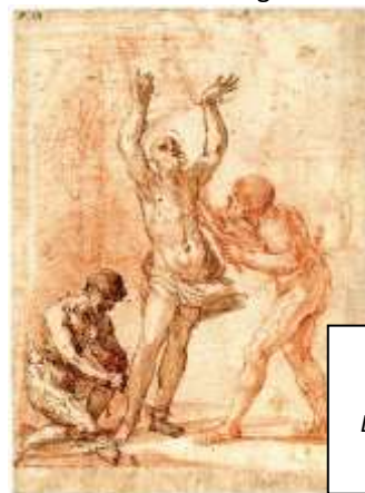
© The Trustees of the British Museum Link to the British Museum connected to this picture

The main hall of the school building was occupied by the Craven and Bradford guilds. They each had tables lining two sides of the hall with items for sale and demonstrations taking place.