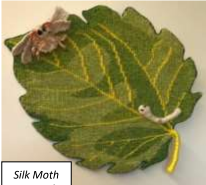
Silk Moth on Leaf

I visited the British Tapestry Group's Exhibition at Whitchurch Silk Mill in November. I have great admiration for the patience of weavers who produce large, detailed tapestries.