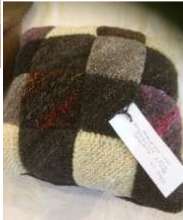
Great Wheel and competition entries

came away with a glorious dark brown and white Jacob