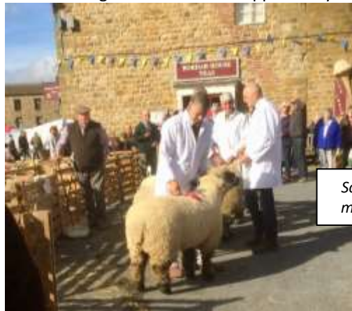
Some of the many sheep

The town hall was also busy, with the trade stands downstairs, including Coastal Colours and Wensleydale Longwool Sheep Shop. Local craft stalls were located upstairs, together with the exhibits in the Woolcraft Competition, categories included Handspun Wool, Dyeing and Weaving. There was an opportunity to