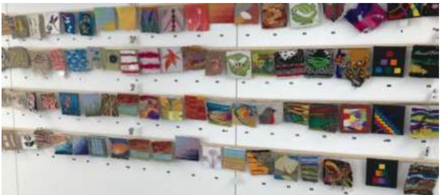
A selection of the many small pieces in the exhibition.

I often wonder about variations in colour perception. One or two of the exhibits made me wonder how anyone could work or live with the colour combinations used. Others were too busy for my taste, but I am very much a "more is less" person. This was confirmed when I looked at the range of small pieces which were on display. There were several which tempted me not just because of the prices!