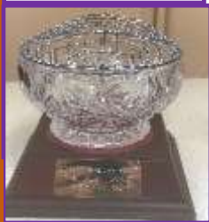
The Dyers' Trophy – anything, natural or chemical dyes

Unfortunately, after setting up all of this I was unable to be at the November meeting. Happily for me, Lynne was able to step into the breach and, from the photos that I have seen, organised it beautifully on the day. Thanks Lynne!