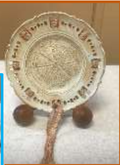
The Diddy Trophy – handspun, hand-knitted or crocheted item