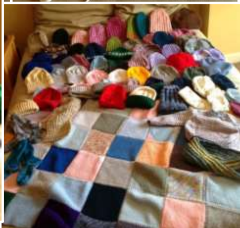
Some of the contents of the latest parcel

Today (3rd Nov) another parcel left for Christian Hope International containing 5 blankets, 15 jumpers, 1 scarf, 1 cowl, 3 mittens, 7 socks and 54 hats!! A very big thank you to all of you who made things. Many of you will have seen Gill bringing in a big Iceland bag full of goodies! Meg has been busy since the October meeting putting together blankets and knee rugs with the help of Gin of course there to supervise!!