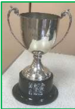
The Weavers' Trophy – favourite piece of weaving from the last two years

Once we were able to meet up again, I decided that it would be good to sort out all the trophies and get them back into some sort of pattern. Hence the four competitions on one day! These were for: